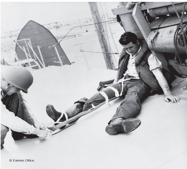
Figure 7: Eames splint in use