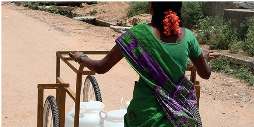
Figure 12: IDEO water trolley