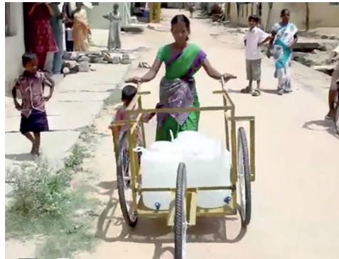
Figure 11: IDEO water trolley