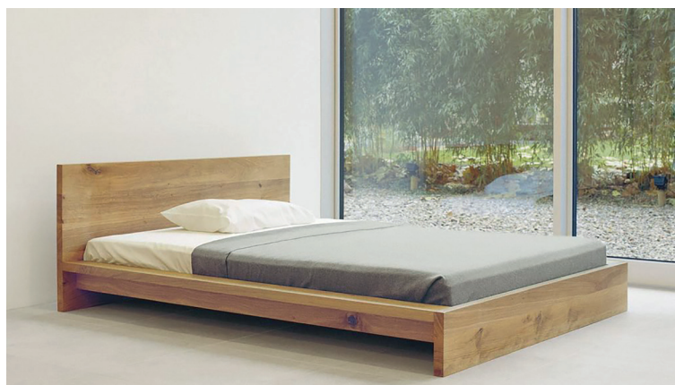
Figure 6: e15 SL02 Mo bed