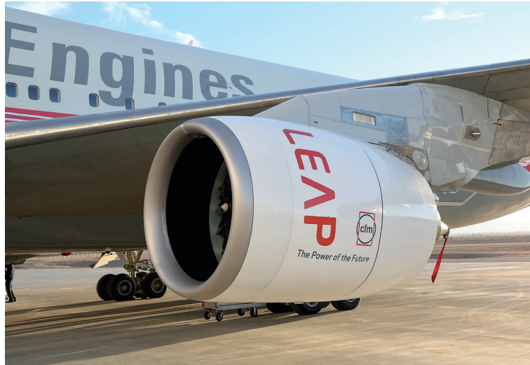
Figure 3: LEAP engine

The LEAP aircraft engine series, see Figure 3 , is the first to contain 3D printed components, see Figure 4 . It is also the first to receive simultaneous type certification by the Federal Aviation Administration and European Aviation Safety Agency.