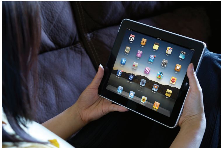
Figure 9: Apple iPad

The iPad was labelled as a competitor to laptops and was the first product of its kind to diffuse into the market. Even though the iPad is a relatively new product, it has already been recognized as a design classic.