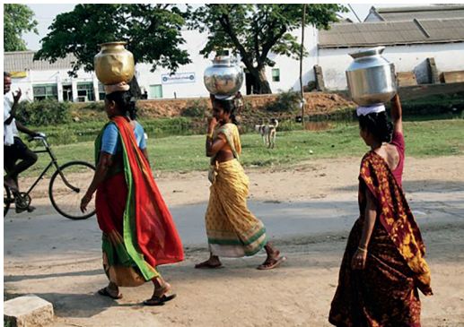
Figure 10: Traditional water carrying

One part of improving access to water was the water trolley made by using locally sourced materials that are easy to obtain. IDEO collaborated with local craftsmen to model a number of design options (see Figures 11 and 12 ).