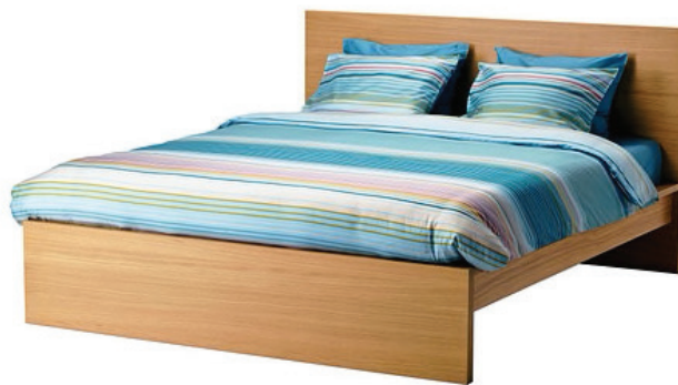
Figure 5: IKEA Malm bed