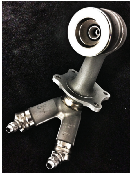
Figure 4: 3D printed fuel nozzle from LEAP engine